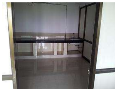
Microscopy Dark Room