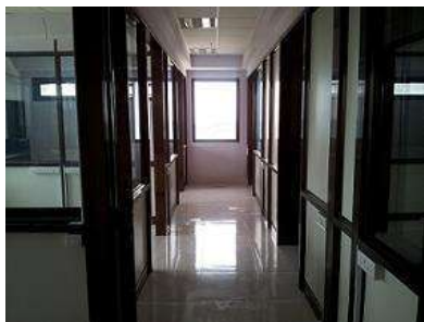
Cell Culture Facility - Overview