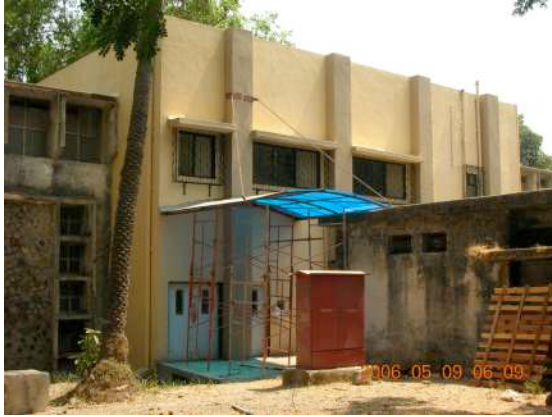
(Building of SMA \mu L)

The new building construction is completed in all the aspects and building is already in use for excimer laser operations and microstereolithography research. The construction got delayed by almost 6 months because of the estate office inefficiencies.