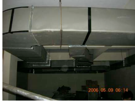
(Clean Room in Progress)